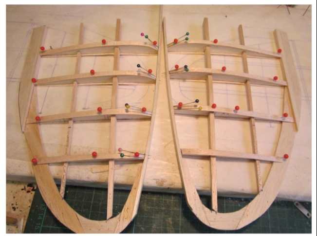
You don't need this many pins when you build with foam