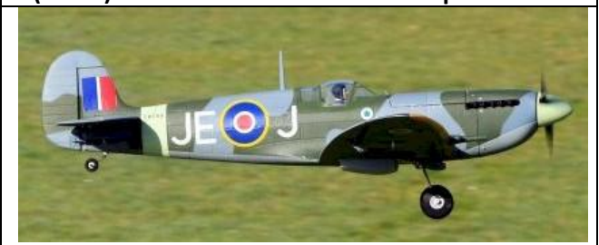
(P.D's.) Spitfire on finals. Now that's great photography