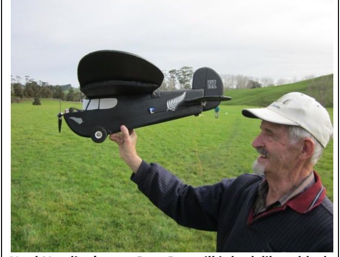
Noel Newling's new Bee. But will it look like a black blob when its flying.