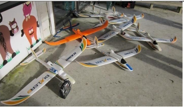
A whole heap of Bixlers seen at the field. Sure makes a change from Bees.