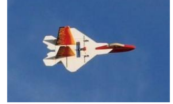
(P.D's.) Homebuilt F22 made from depron foam.