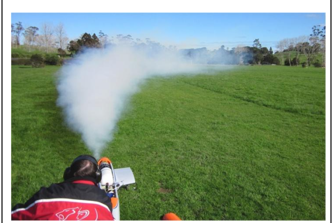
Smoke, smoke and more smoke. Ross Purdy tries out the new smoke unit in his new jet.