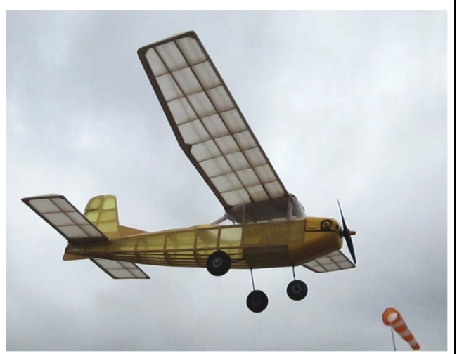
Stan Somerfield's free flight Vick Smeed designed Debutant coming in on finals