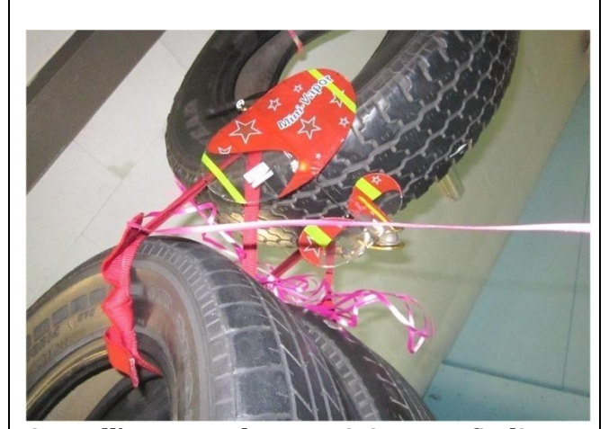
Jim Hall's new ParkZone Mini Vapor finding where the tyres are at the indoor flying.